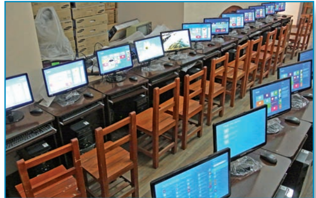
library turned into computer lab

One year after our pledge, 20 PCs with Internet connectivity have been delivered to Colegio Pichincha (a secondary school with 800 pupils) in Potosí. A big thank you goes to the (now) 3rd year pupils from the Praedinius Secondary School in Groningen who raised a grand total of € 5,252 towards this project. Other benefactors included the Van Leer Foundation, the Jephcott Foundation, Colour4Kids, and the Internet provider COTAP, all of whom helped bring this proposal to fruition. This is a great step forwards for education in Potosí and will provide the (mine worker) youths with many more opportunities. The city of Potosí contributed 15 computers, the students won 8 in a competition, bringing the total to 43 altogether. Now we're getting somewhere!