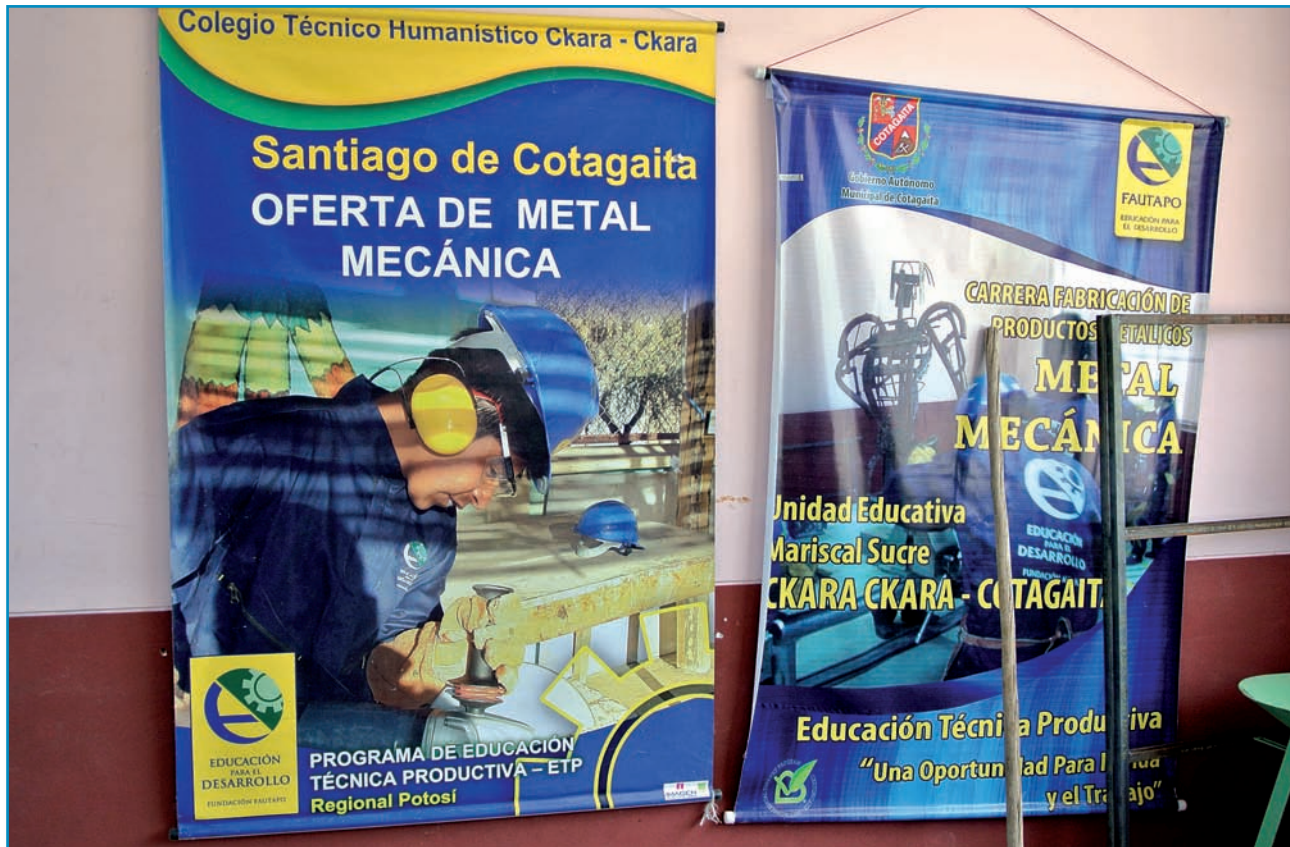
Fautapo: more employment opportunities through training