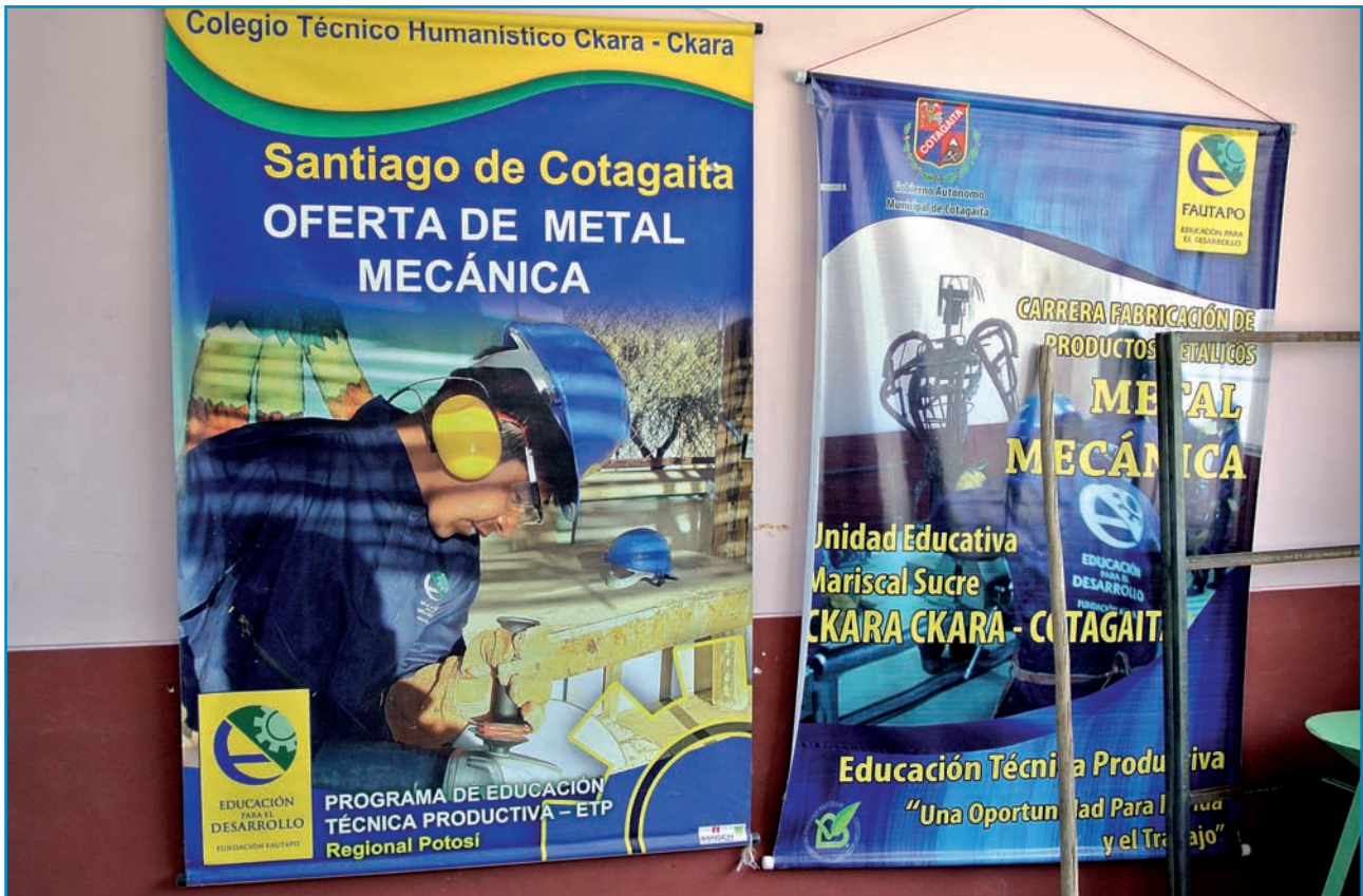
Fautapo: more employment opportunities through training