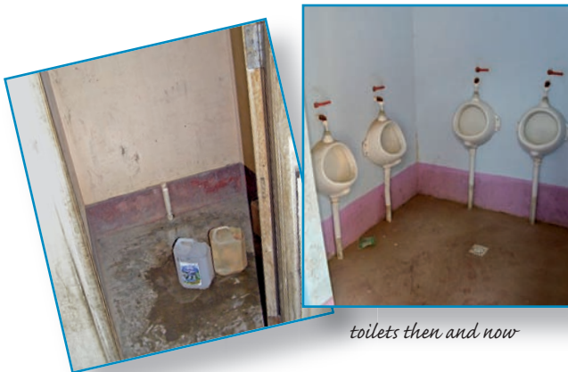
toilets then and now