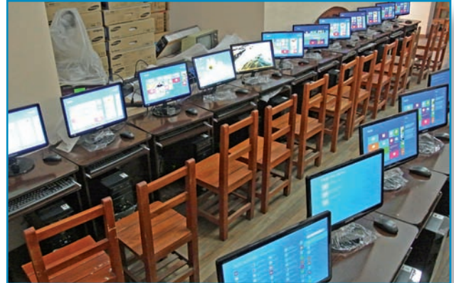
library turned into computer lab

One year after our pledge, 20 PCs with Internet connectivity have been delivered to Colegio Pichincha (a secondary school with 800 pupils) in Potosí. A big thank you goes to the (now) 3rd year pupils from the Praedinius Secondary School in Groningen who raised a grand total of € 5,252 towards this project. Other benefactors included the Van Leer Foundation, the Jephcott Foundation, Colour4Kids, and the Internet provider COTAP, all of whom helped bring this proposal to fruition. This is a great step forwards for education in Potosí and will provide the (mine worker) youths with many more opportunities. The city of Potosí contributed 15 computers, the students won 8 in a competition, bringing the total to 43 altogether. Now we're getting somewhere!