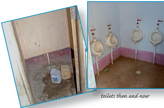
toilets then and now